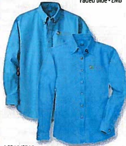
ITEM 4 - Long Sleeve Denim Shirt - Mens & Ladies Cut Faded Blue - EMB