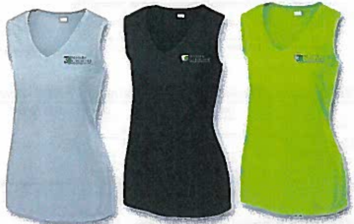
ITEM 2 - Sleeveless Wicking V-Neck - Ladies Cut Silver, Black, & Lime - Printing