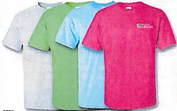
ITEM 1 - Short Sleeve T-Shirts - Unisex Cut Sport Grey, Lime Green, Light Blue, & Heliconia - Printing

MOUNTAIN Promotions MOUNTAIN-PROMOTIONS.COM