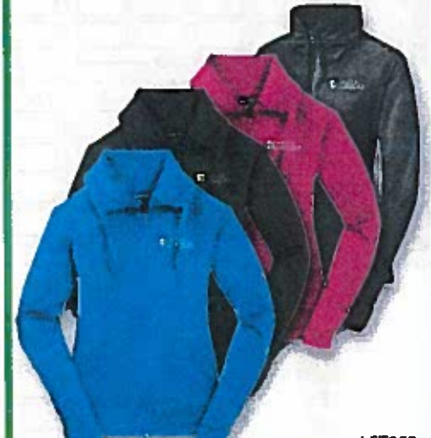
ITEM 5 - Full Zip Performance Jacket - Ladies Cut Peacock Blue, Black, Pink Rush, Charcoal - EMB