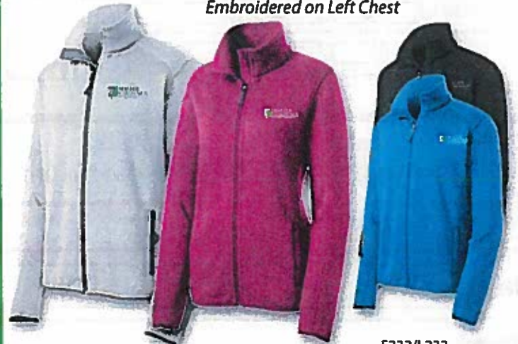
ITEM 7 - Port Authority® Sweater Fleece - Mens & Ladies Cuts Grey Heather, Pink Heather, Black Heather, Blue Heather Embroidered on Left Chest