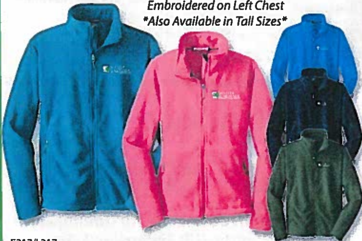
ITEM 6 - Port Authority® Fleece Jacket - Mens & Ladies Cuts Teal Blue, Pink Blossom, Royal Blue, Navy Blue, and Forest Green Embroidered on Left Chest *Also Available in Tall Sizes*