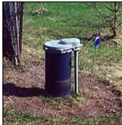
Keeping a well clear of shrubs and long grass is a good practice to help limit the presence of small animals and insects that can carry bacteria.

For $15 (normally $49), well owners could participate in the "Homeowners Package," which includes tests for bacteria and nitrate-nitrogen, two of the most common health related water concerns. In addition, pH, hardness, alkalinity, conductivity, chloride, and corrosivity are also measured. Other test packages were also available, including a "Metals Package" for $20 that tests for arsenic, lead, and nine other metals, and a "Triazine Screen" for $27 that tests for the presence of atrazine pesticides.