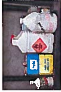
Just a small sampling of hazardous household items.

These items are typically found in your barn, basement, garage, under the kitchen sink, craft area, workshop, etc. Look for key words on the label like: danger, warning, poison, combustible, and toxic.