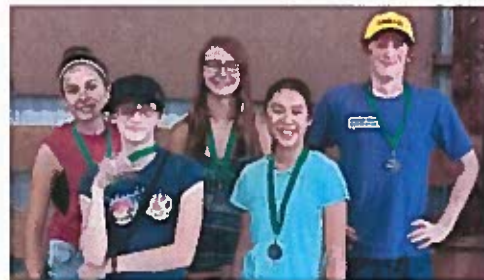
Anything Goes 2nd Place Team – Spring Valley