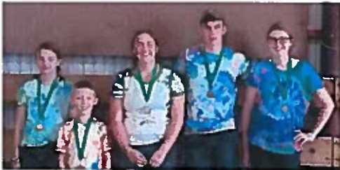
Anything Goes 1 st Place Team – All on 4’s