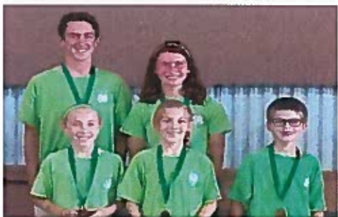
Anything Goes 3rd Place Team – Willing Workers